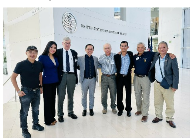
The Vietnamese-American Team at the United States Institute of Peace, Washington

The day after the premier of the film at the USIP conference, Fragments of Memory was presented on the giant screen at Alamo theater in Crystal City. Short introductory presentations to that audience were made by the DPAA, Veterans of Foreign Wars, and Vietnam Veterans of America prior to the viewing of the film. After the presentation, those who participated in locating the LZ Bird gravesite, American and Vietnamese, again did presentations, which quickly became a Question & Answer session about finding the mass graves. It was well received by all except the head of the VVA who fell asleep, seemingly more interested in the free popcorn.