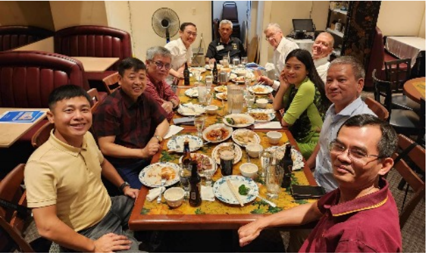
A few of the search and film team share a casual lunch in Washington DC

Company website (<u>www.cattrack6india.com</u>) or at https://www.youtube.com/watch?v=SUM48_3iCEo